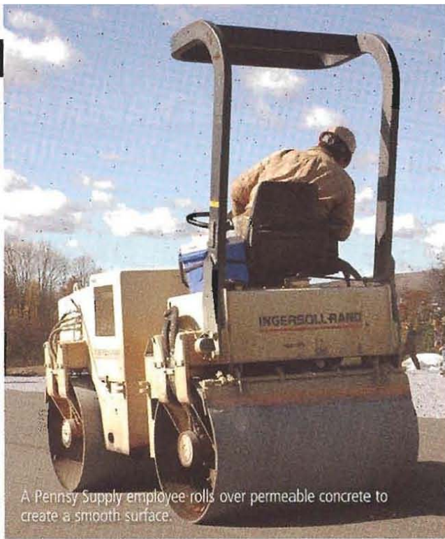
A Pennsy Supply employee rolls over permeable concrete to create a smooth surface.

System is the standard for determining a building's degree of sustainability. At least two credits toward a LEED certification can be attained by using a permeable pavement stormwater system — one credit for managing rate and quantity of stormwater and another for managing water quality, Wible says. Both are achievable if they are designed and installed properly. There are many other credits available depending if concrete or asphalt surface is chosen including rainwater collected and used onsite, innovation in design, heat island reduction, and others. If a building or property receives enough credits, it is LEED-certified as a sustainable property, which is very attractive when property owners plan to sell or lease a building. Indirectly, this could lead to more properties using the pervious concrete in place of other materials.